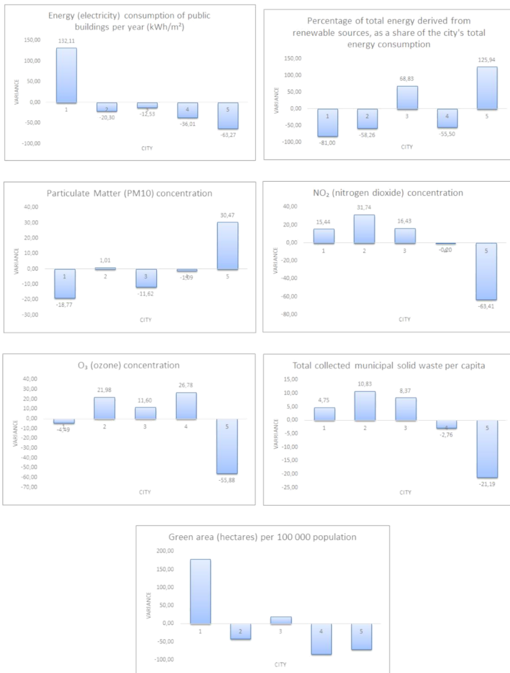
Fig. 3. Indicators considered in this study.

[20] ROADMAP 2050. A practical guide to a prosperous low-carbon Europe. http://www.roadmap2050.eu/attachments/files/Volume1_fullreport_PressPack.pdf