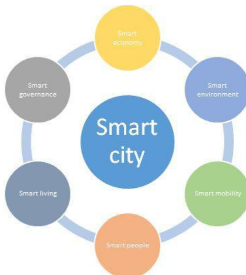
Fig. 1. Characteristics of a Smart City

Complementary to the technological solutions proposed by the aforementioned organizations, other initiatives are addressing the regulation side of what a Smart City should be. The BSI has published the PAS 180 and PAS 181 whose main goal is to clearly spell-out a common language and a set of smart-city metrics [13]. Other major initiatives are the Global City Indicators Facility [14] and the European ranking of Smart Cities [15]. In general, when talking about Smart Cities, the previous initiatives focus their efforts in the characteristics show in Figure 1.